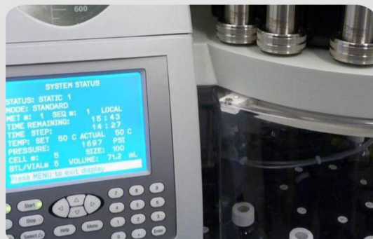
Equipment for Pressurized Liquid Extraction at partner Fraunhofer