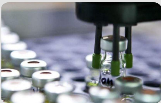
Experimental facilities at partner Natac

In WP 1 Algae Production and harvesting partners Necton and CMP/AlgaFarm are responsible for production and supply of algae biomass of the targeted algae species Nannochloropsis oceanica , Phaeodactylum tricornutum and Isochrysis galbana for biorefinery development and bioproduct application. Necton successfully established prototype production protocols and supplied algae biomass. CMP successfully performed pilot scale production. Optimization of the production process (culture medium, energy consumption and thermoregulation) from lab to pilot scale is ongoing. In parallel, partners WU and WFBR address optimization of wild type strains aimed at the production of polyunsaturated fatty acids, phospholipids and fucoxanthin.