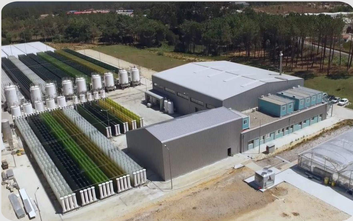
Cultivation facilities of partner CMP