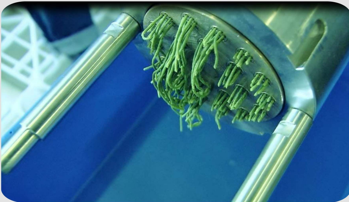
Production of fish feed containing microalgae at partner Sparos